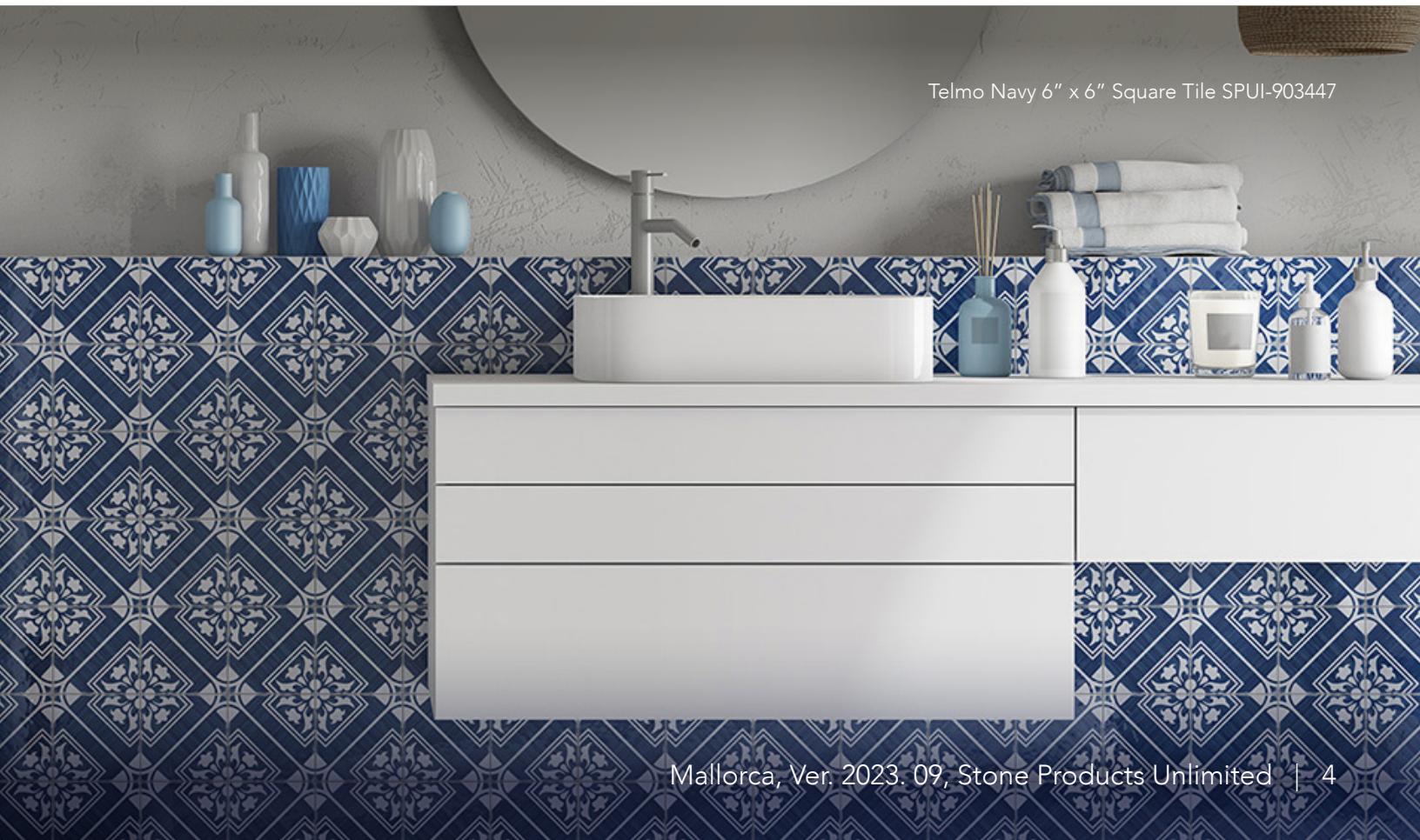
Telmo Navy 6" x 6" Square Tile SPUI-903447